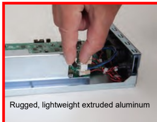
Rugged, lightweight extruded aluminum