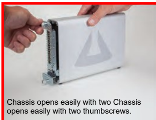
Chassis opens easily with two Chassis opens easily with two thumbscrews.