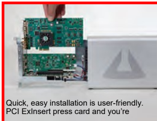
Quick, easy installation is user-friendly. PCI Express card and you're