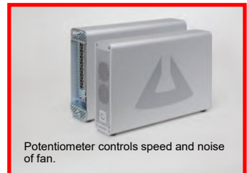
Potentiometer controls speed and noise of fan.